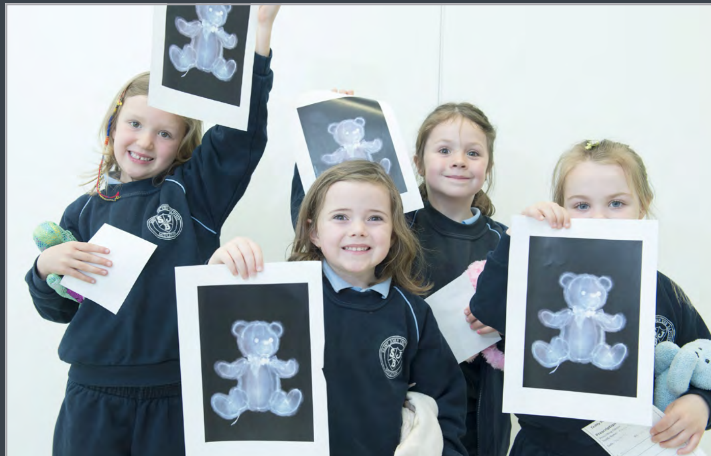
Surprises and fun at the annual Teddy Bear Hospital event