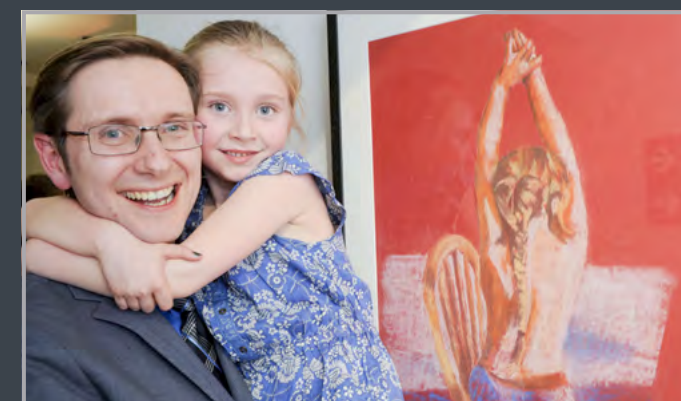
First solo exhibition