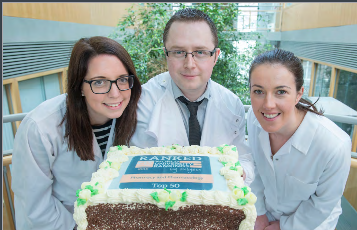
Pharmacy and Pharmacology