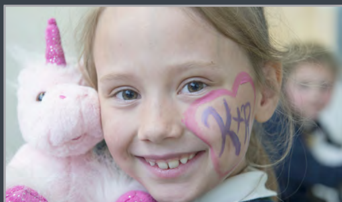
Teddy Bear Hospital