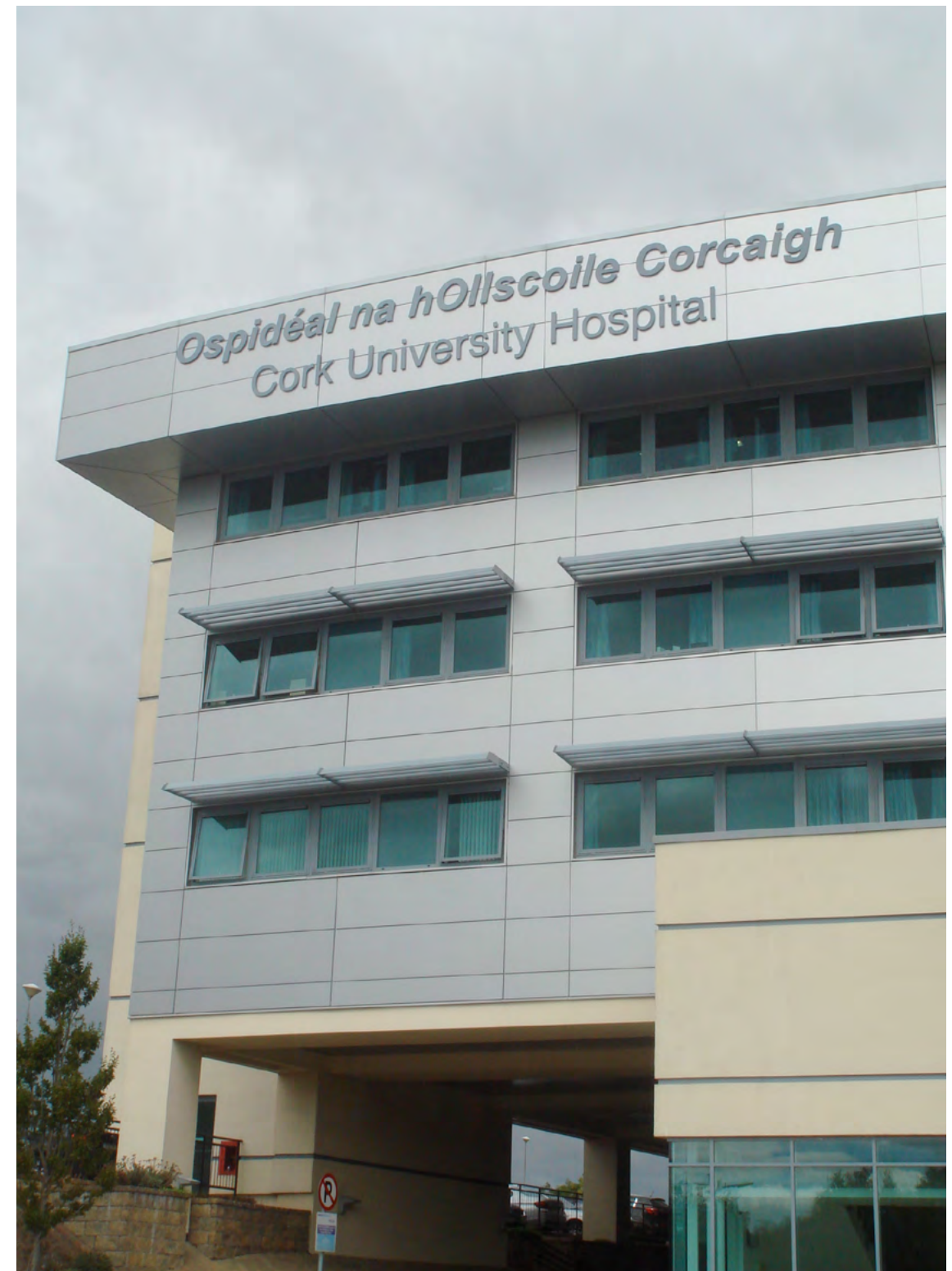
Cork University Hospital

www.ucc.ie/en/med-health/news/fullstory-542835-en.html