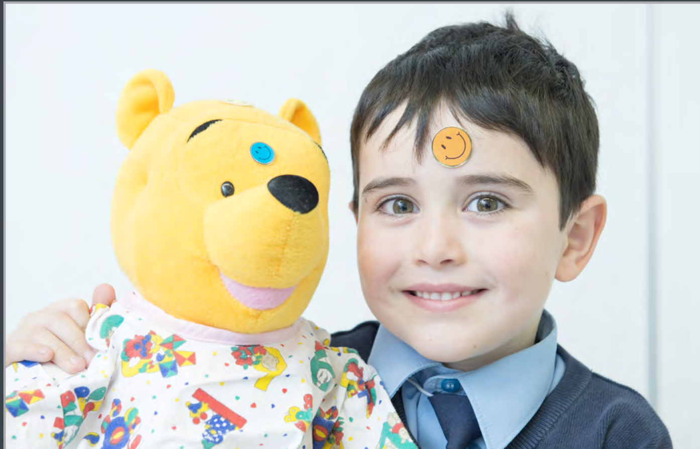
Teddy Bear Hospital