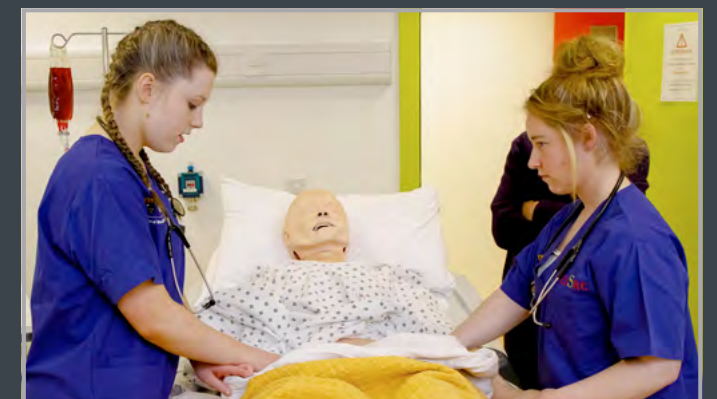
Nurse for a Day