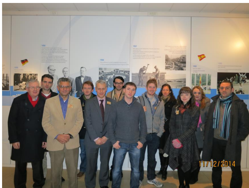
Staff and students at NATO