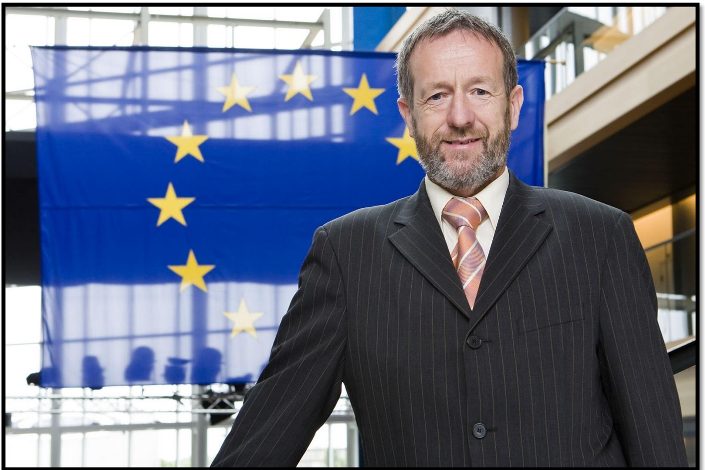
Sean Kelly, MEP, met with students in the European Parliament