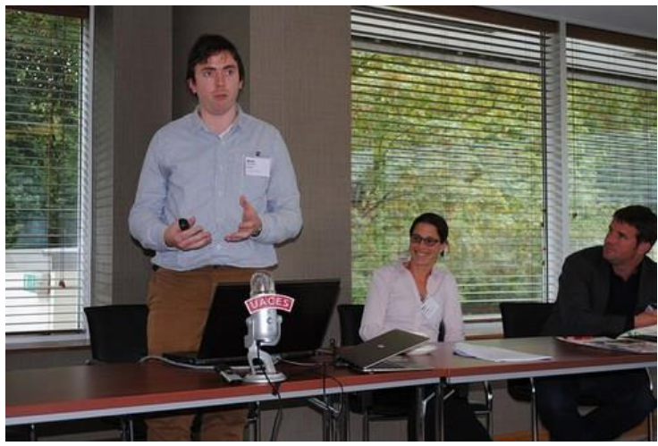
There were some excellent panels and papers during the conference.