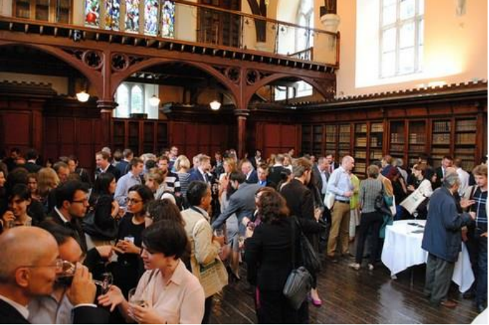
The Aula Maxima was packed for the conference drinks reception.