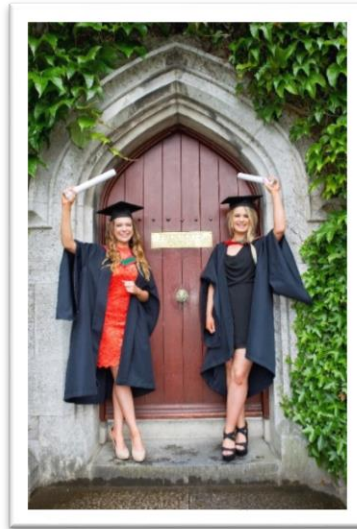
Graduating BSc Students