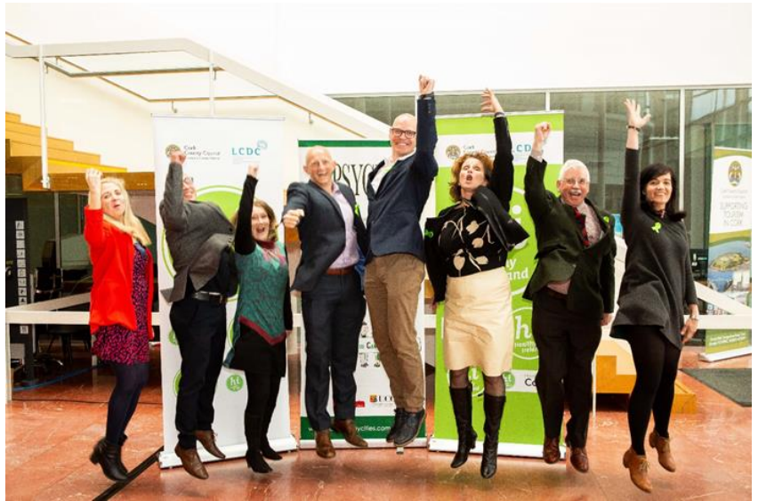
Psyched Steering group during annual celebration evening in Cork County Hall, 8 th May 2019.

On 8 th May 2019, we celebrated the achievements award-winning organisations from the Cork area during the annual Psyched awards celebrations with amazing case studies of mental health and wellbeing promotion from private and public organisations and NGOs of all sizes (large multi-national to local micro organisations).