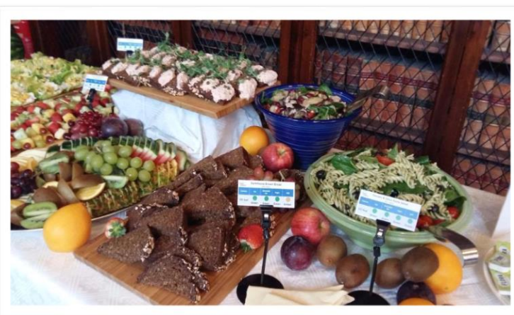
Healthy Lunch with Traffic Light Labelling