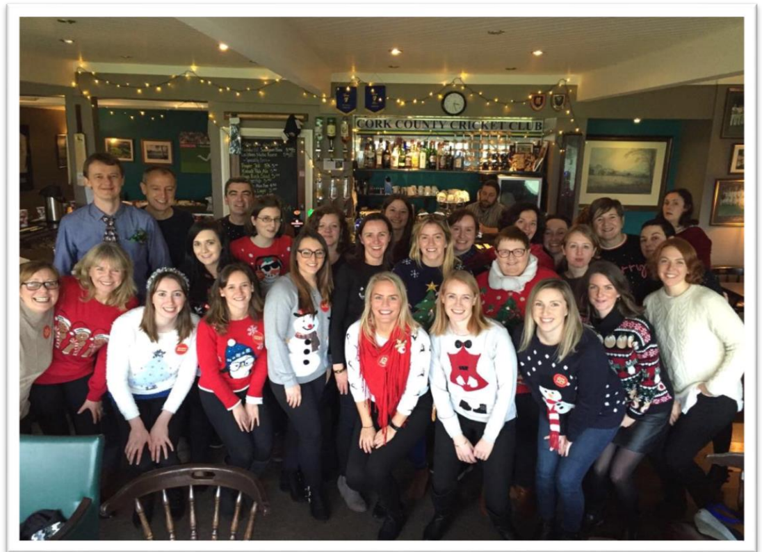
Festive fun in aid of the Simon Community at the School of Public Health Christmas Party

The housing crisis is pushing people into homelessness and preventing people from leaving homelessness. The Emergency Shelter in Cork is overflowing with an average of 53 people per night relying on a Cork Simon emergency bed. People are staying for longer and longer in emergency accommodation because they have no other options. The Cork Simon Community works in solidarity with men and women who are homeless in Cork, offering housing and supporting their journeys back to independent living. The School of Public Health were delighted to participate in Cork Simon Community's Christmas Jumper Day to support this worthy cause. PhD Student