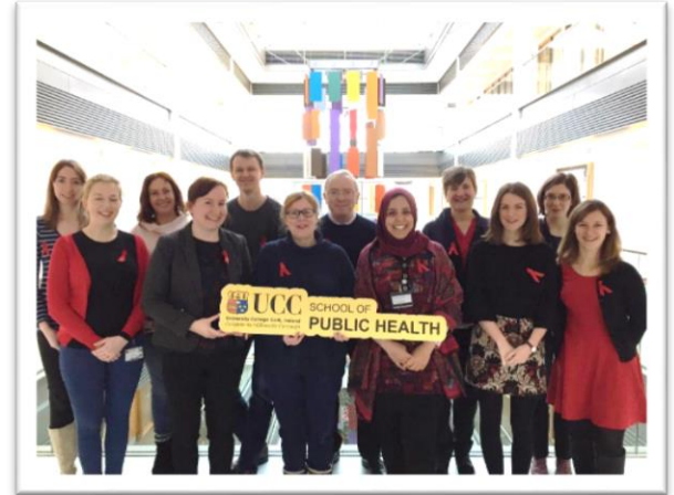
School of Public Health staff supporting World Aids Day on December