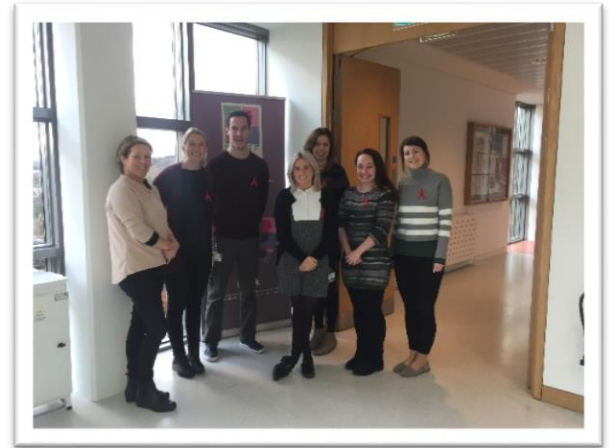
National Suicide Research Foundation supporting World AIDS Day