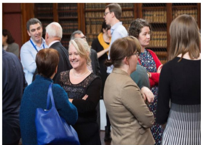
Catching up at the Launch of the School of Public Health