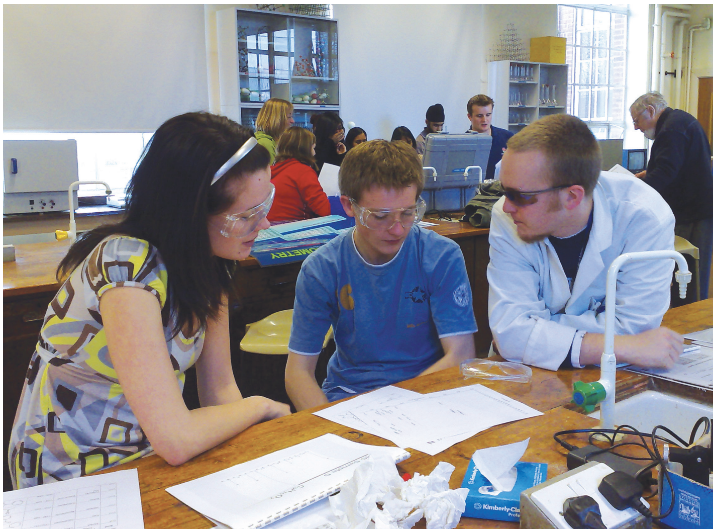
Postgraduate discusses results with school students

delivering activities to over 26 000 students through more than 520 events. With teachers keen to secure repeat bookings, the success and popularity of Spectroscopy in a Suitcase is clear for all to see.